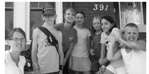
The THINK Together crew

During the fall the kids took part in an outreach program. We went door-