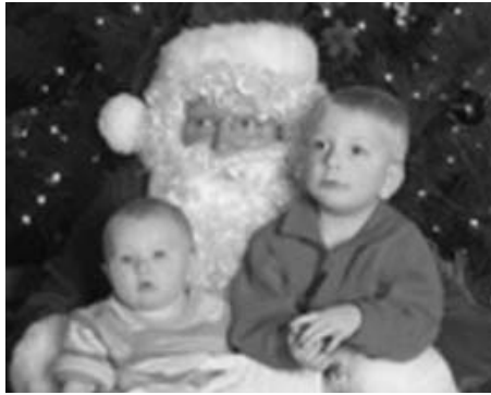
Sitting on Santa's lap is always fun!

Students from Hempstead and Wahlert High School and one from