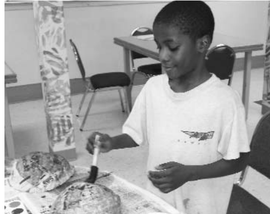
An artist at work

While each of these components may seem slight, when they are put together to provide the extraordinary program we accomplish each school day, they become part of a life-changing experience that helps our students to grow, to thrive and to believe in themselves.