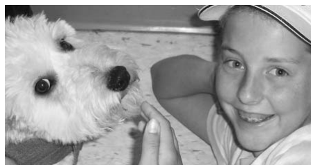
Reading with Rover

In January we had a visit from the Dubuque Humane Society along with a few of their animal friends. The students learned about animal safety, especially what to do if a dog is attacking them.