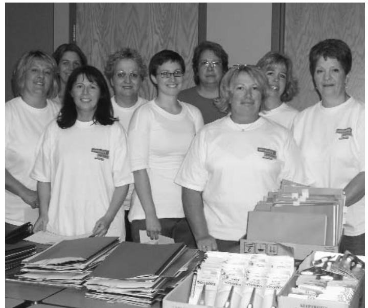
Our volunteers are wonderful!

Please mark the left-hand corner of your check "Apples for Students." St. Mark's is a 501 C3 organization, so your gift is tax deductible. Thank you!