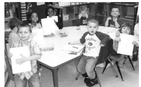
Do you like my paper?

In February we celebrated Valentines Day with our preschool friends, and we enjoyed a relaxing day in our own pajamas. The kids were given tickets to purchase popcorn and juice while watching a Clifford video. There is something special about snuggling up to a