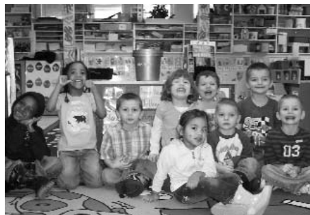
Head Start smiles

Wow! This has been quite a winter. Even though we haven't been able to go outside, we certainly have not been hibernating. The weather gave us the perfect opportunity to have a hands-on approach to learning about snow, winter clothes and winter animals. We even wrote our very own story about Polar Bears. (Keep in mind that these are three and four-year olds.)