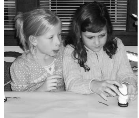
Do you need help?

tionships they have formed. All of our students seem to look forward to spending time together after school. It is wonderful to see them smile and greet each other upon arrival. It is also great to hear new students who were previously skeptical of the program tell us they "like it here!" We can tell they enjoy the program and feel safe and comfortable here. In turn, I have also enjoyed getting to know these unique, amazing children. I learn a lot from them, as they learn from me.